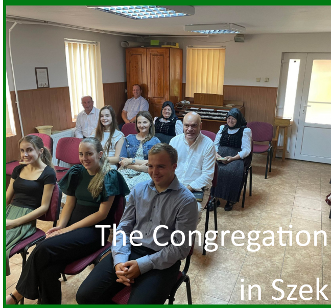
The Congregation in Szek

A Bible camp was once again held in the last days of August, from 28-30. By the grace of God, many children came to the camp each day. By the second day more than 68 had come. The final three days saw more than 85 children in attendance. These days were blessed as the children were very attentive and said they look forward to enjoying these